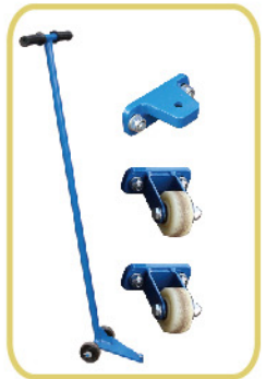
option: Lift table mover(TM01)