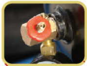
Air charging port and Pressure regulating knob