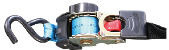
AUTOMATIC RECOVERY RATCHET BUCKLE