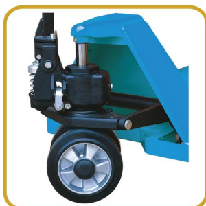
Two Years Warranty Pump!