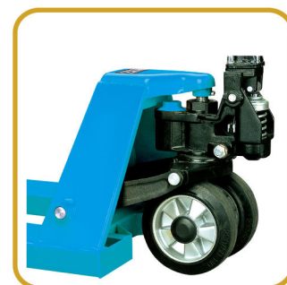
Two Years Warranty Pump!