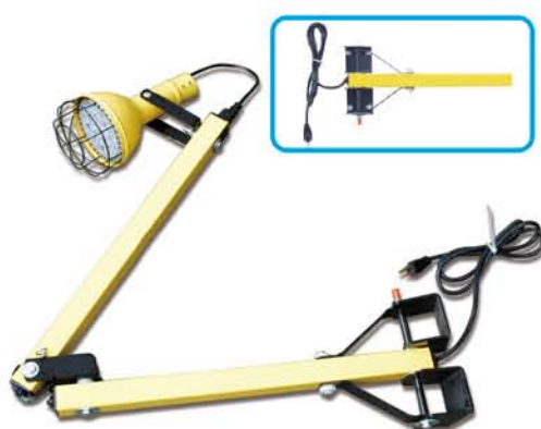
DLS Single Wall Mount