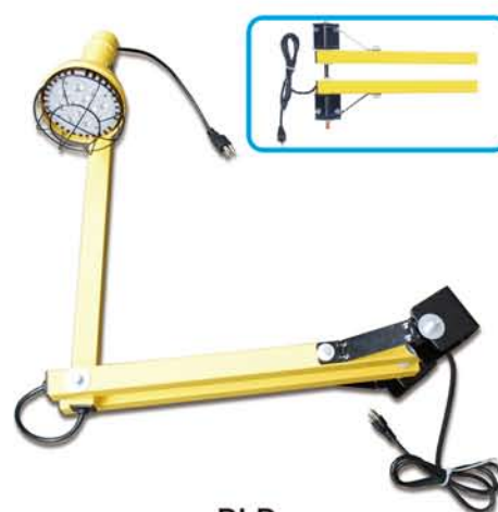
DLD Double Wall Mount