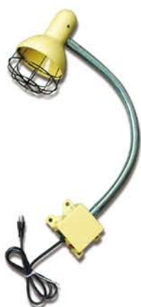
DLF Flexible Tube