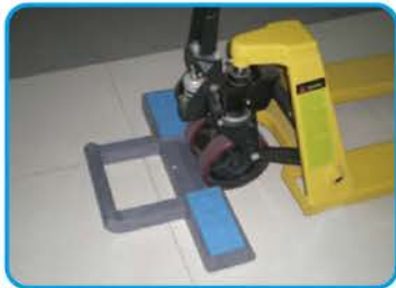
Easy to enter into due to slope design.