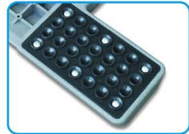
Special design for increasing friction to the ground.