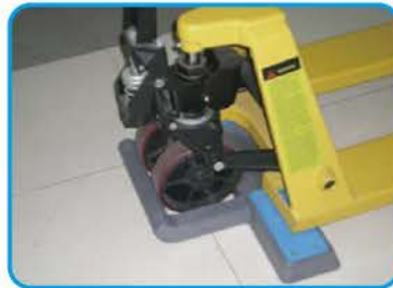
The chassis is supported by the stop. The wheel is hanged to prevent moving.